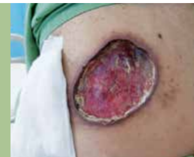
After 3 days of silver alginate dressing